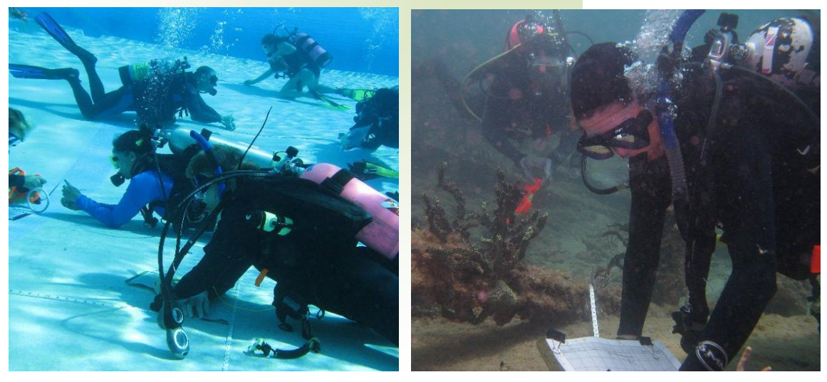
Inaugural SSEAS class practicing recording skills in pool and on SS Copenhagen, a Florida Underwater Archaeological Preserve