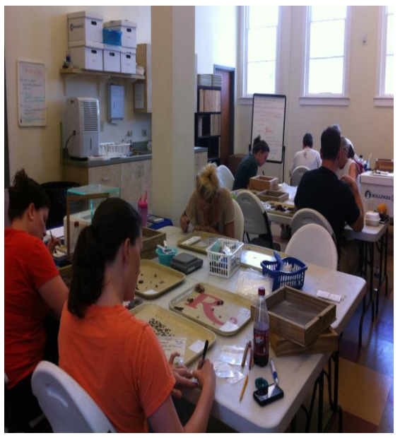
Volunteers in the FPAN Lab

Looking for something new to do this fall? Come experience history and volunteer in the FPAN archaeology lab!